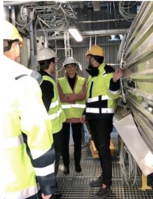
The Crown princess couple is being guided around the plant by Cortus