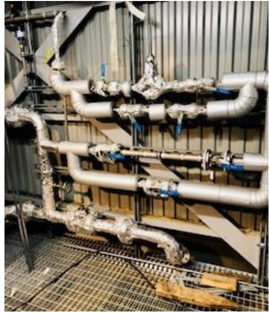
Piping system for water supply