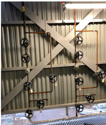
Piping system for steam and steam condensate