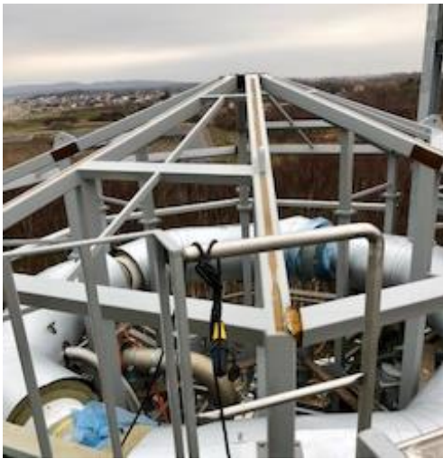
The flue gas gloria installed on top of the gasifier