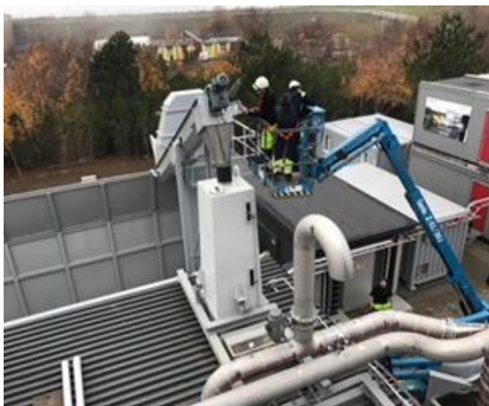
Biomass pocket with feeding- and transport screws were tested with and without material during November.