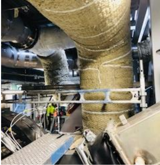
Piping system to the dryer with hot flue gases from the pyrolysis

During November, the installation work in Höganäs has continued, cold tests of the first process steps, i.e. the biomass and dryer, have started and installation work continues to follow the revised timetable with minor adjustments. The pipework is proceeding at high speed and during the month, X-ray of pipes has also begun, and the insulation of pipes is still ongoing.