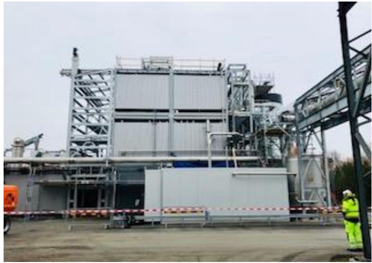
X-ray of pipes