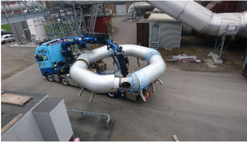
Transport of the flue gas gloria

During December, the work to complete the plant will continue and the plan to produce gas in early 2019 will remain.